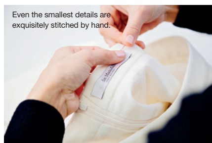
Even the smallest details are exquisitely stitched by hand.

occasions. So, regardless whether you are looking for a memorable wedding gown or a dress for a grand entrance on the red carpet, for bespoke suits and shirts for businessmen and women, or for corporate fashion concepts, Die Manufaktur should be your first point of contact," Baumberger elaborates.