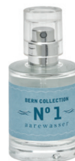
The 'Aarewasser'.